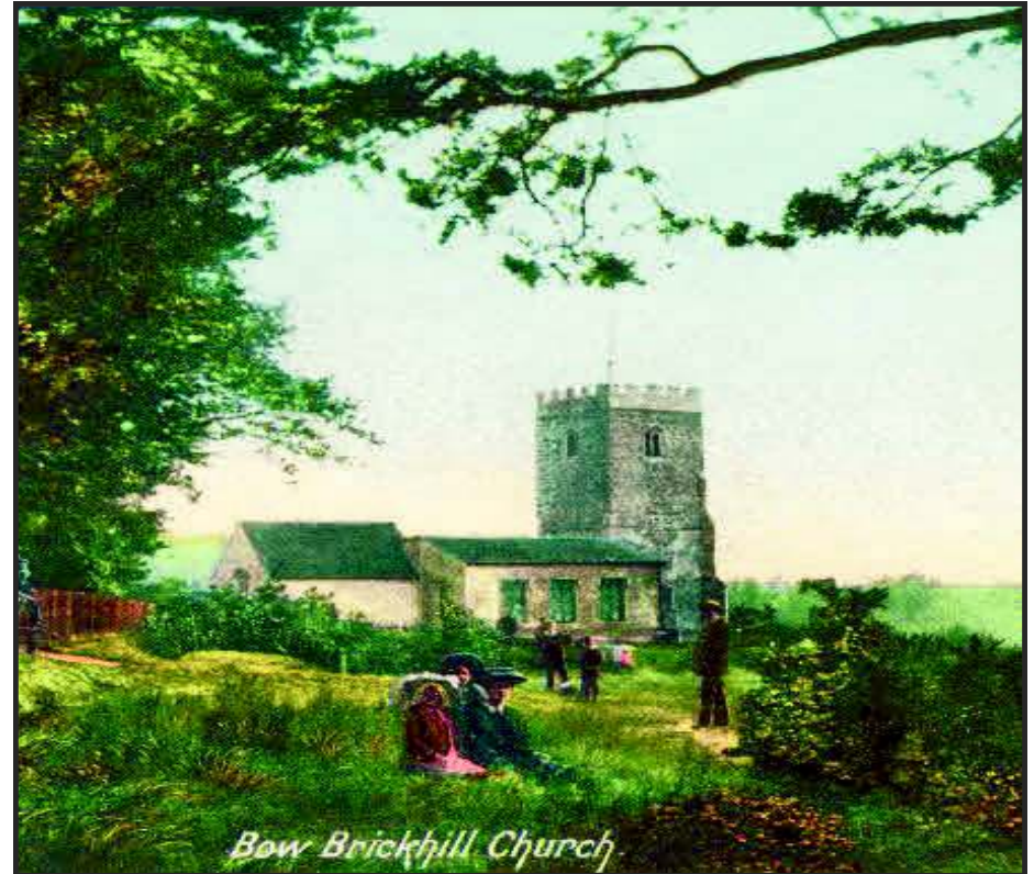
Bow Brickhill Church

If you have any photos of the village suitable for the front cover please send them to ann@asatraining.freeserve.co.uk ( B & W is best)